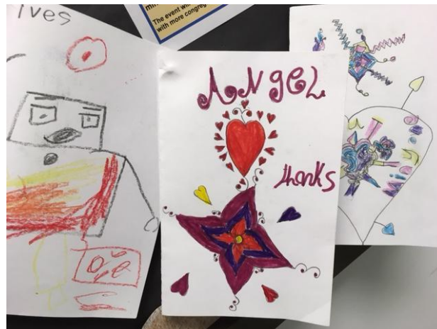
Hand-made thank you's from our adopted family.